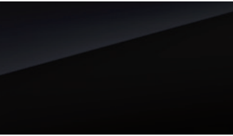
Polar Night black